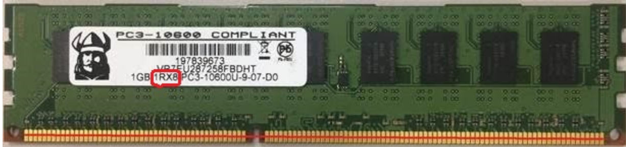
Figure-2 Viking Module example

ranks (quad rank), or eight ranks (octal rank). Viking denotes this on the module label as 1Rx8, 1Rx4, or 2Rx4, 2Rx8, or similar [Figure-2].